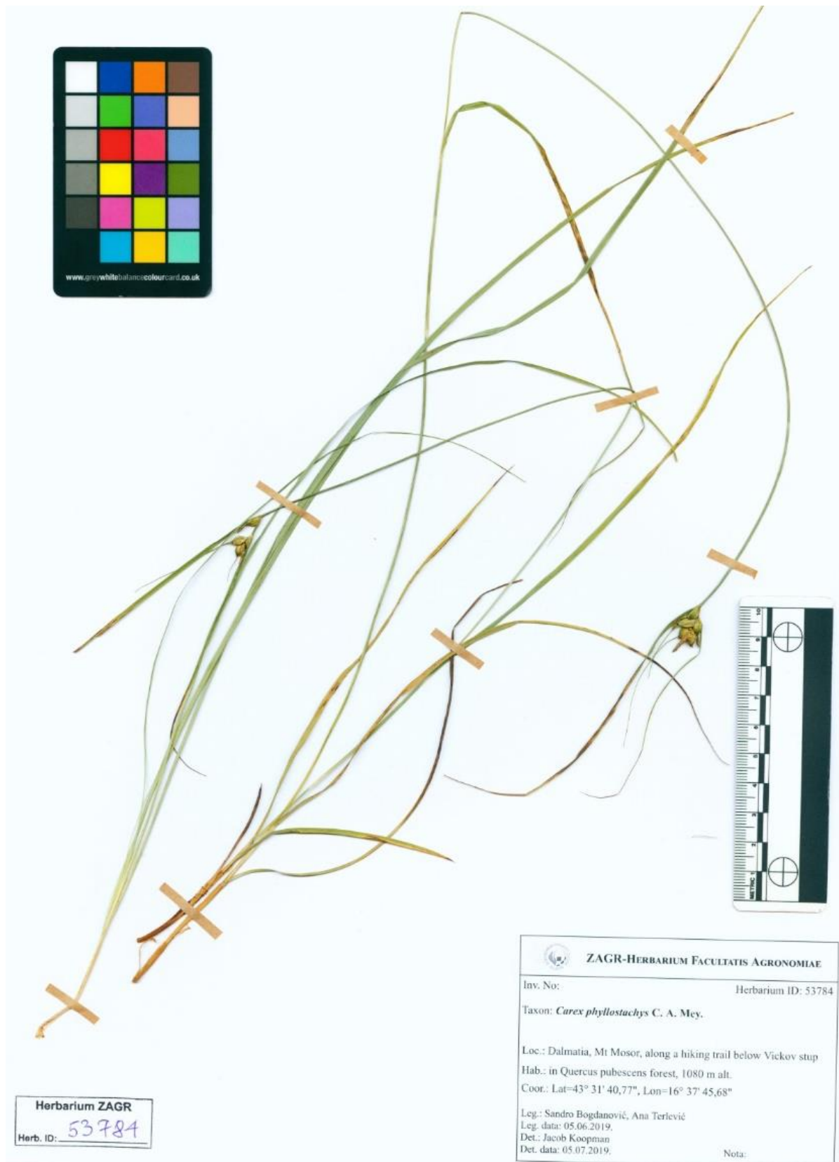
Fig. 2. Herbarium specimen of Carex phyllostachys C.A.Mey. collected on Mosor Mt in 2019 (ZAGR-53784).