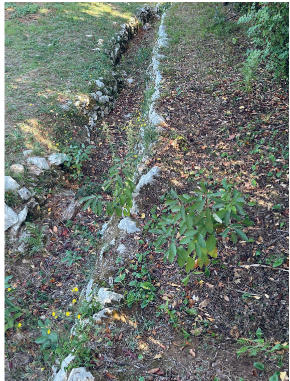
Figure 4. Continued wild spread of D. virginiana on Koločep island, October 2023

Slika 3. Mladi primjerak D. virginiana samoniklo raste u suhozidu na otoku Koločepu, listopad 2023.