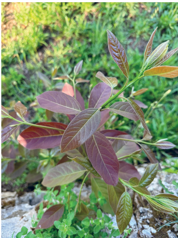
Figure 5. Young leaves of D. virginiana , Koločep island, June 2023

Slika 4. Kontinuirano samoniklo širenje D. virginiana na otoku Koločepu, listopad 2023.