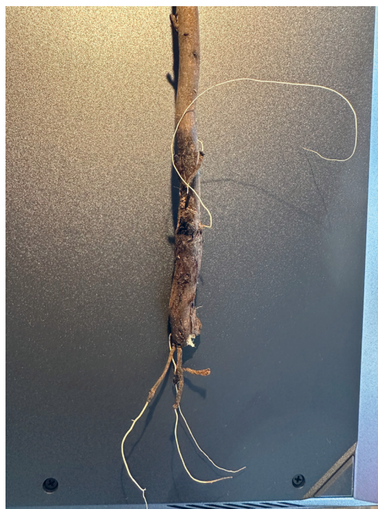
Figures 8.a and 8.b. Rooting system of D. virginiana, Koločep island, August 2023

Slika 8a. i 8b. Korijski sustav D. virginiana, otok Koločep, kolovoz 2023