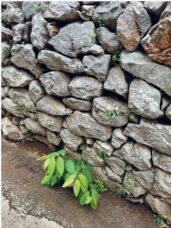
Figure 3. Young specimen of D. virginiana grows wild in a dry stone wall on Koločep island, October 2023

Slika 3. Mladi primjerak D. virginiana samoniklo raste u suhozidu na otoku Koločepu, listopad 2023.