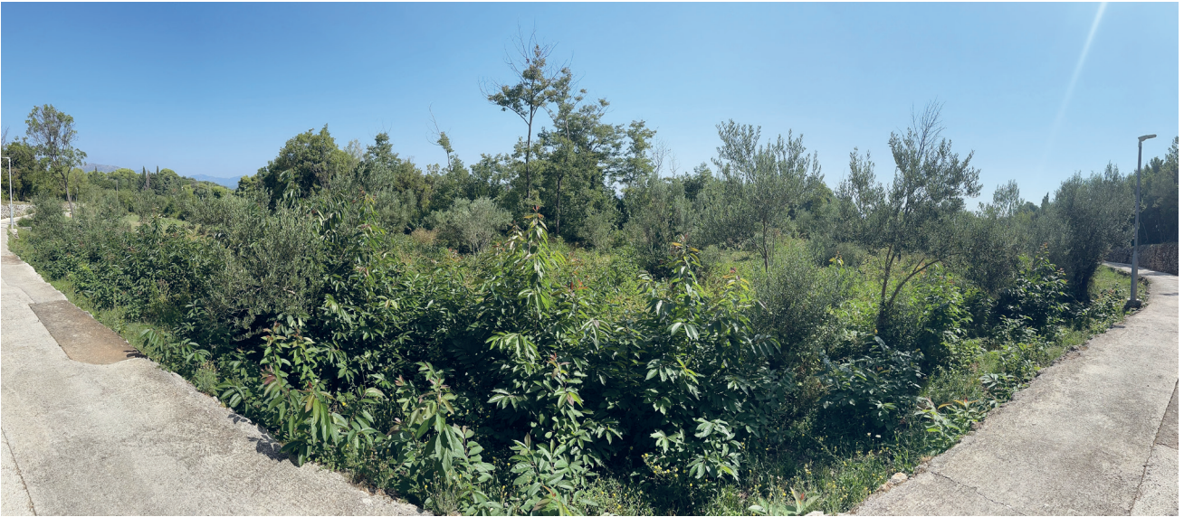
Figure 2. Plot of land near the pathway connecting the two main settlements of Gornje Čelo and Donje Čelo on Koločep island where Diospyros virginiana L. spontaneously appeared about four years ago (photo: M. Marić, July 2023)

Slika 2. Parcela u blizini staze koja povezuje dva glavna naselja Gornje Čelo i Donje Čelo na otoku Koločepu gdje se Diospyros virginiana L. spontano pojavila prije otprilike četiri godine (foto: M. Marić, srpanj 2023.)