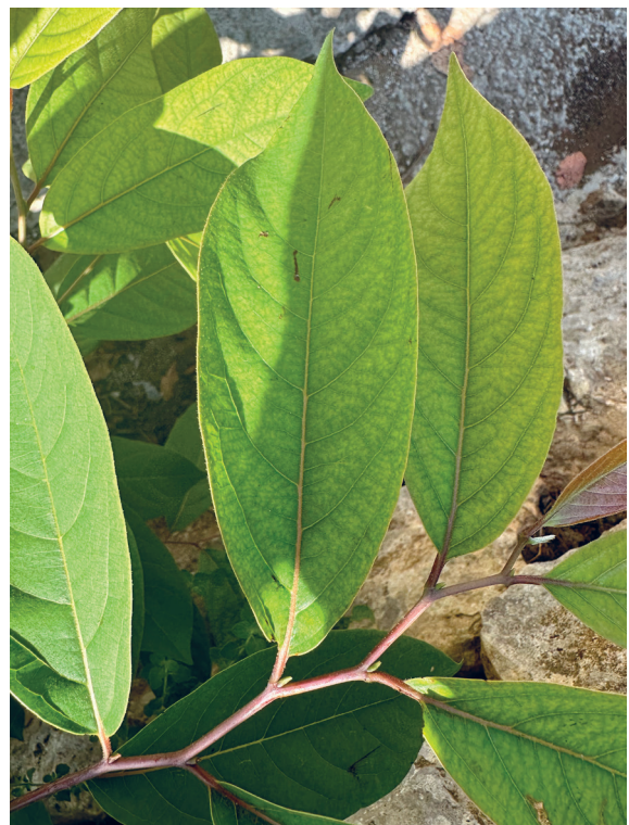
Figure 6. Leaves of D. virginiana - shoot growth complete; foliage fully dark green, Koločep island, October 2023

Slika 5. Mladi listovi D. virginiana na otoku Koločepu, lipanj 2023.