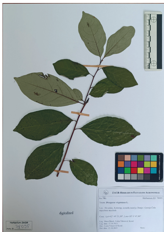
Figure 9. Digitalised specimen of Diospyros virginiana L. from Koločep island in ZAGR online Herbarium, November 2023

Slika 9. Digitalizirana vrsta Diospyros virginiana L. s otoka Koločepa u online ZAGR herbariju, studeni 2023.