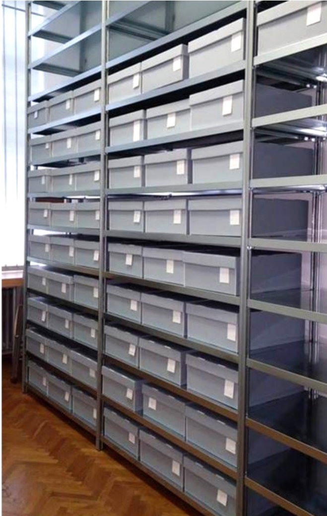
Figure 1. Organisation of ZAGR collection